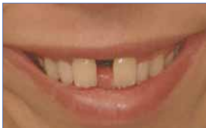
DISTRACTOR IN ACTION

Clean the distractor daily with a soft children's toothbrush.